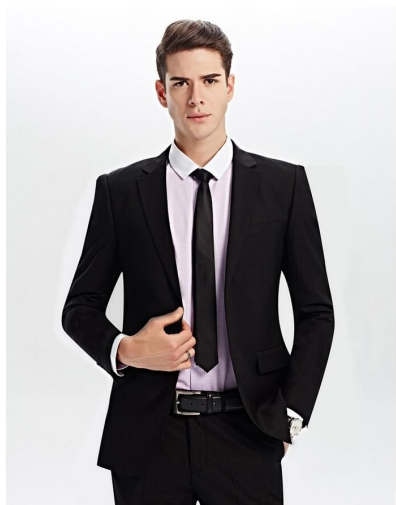
Shirt and Tie, Dress pants