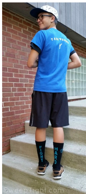
Shorts, t-shirt, ball cap