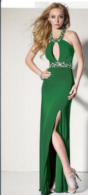
Keyhole too low