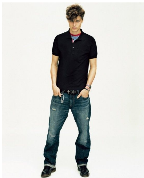
Jeans, no tie