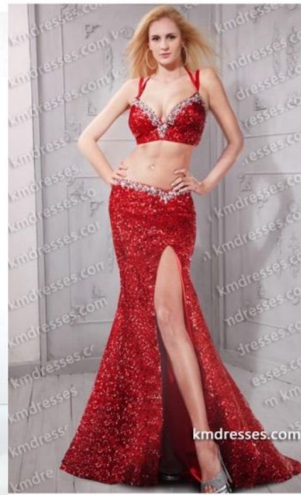
Midriff too revealing and opening by leg to high